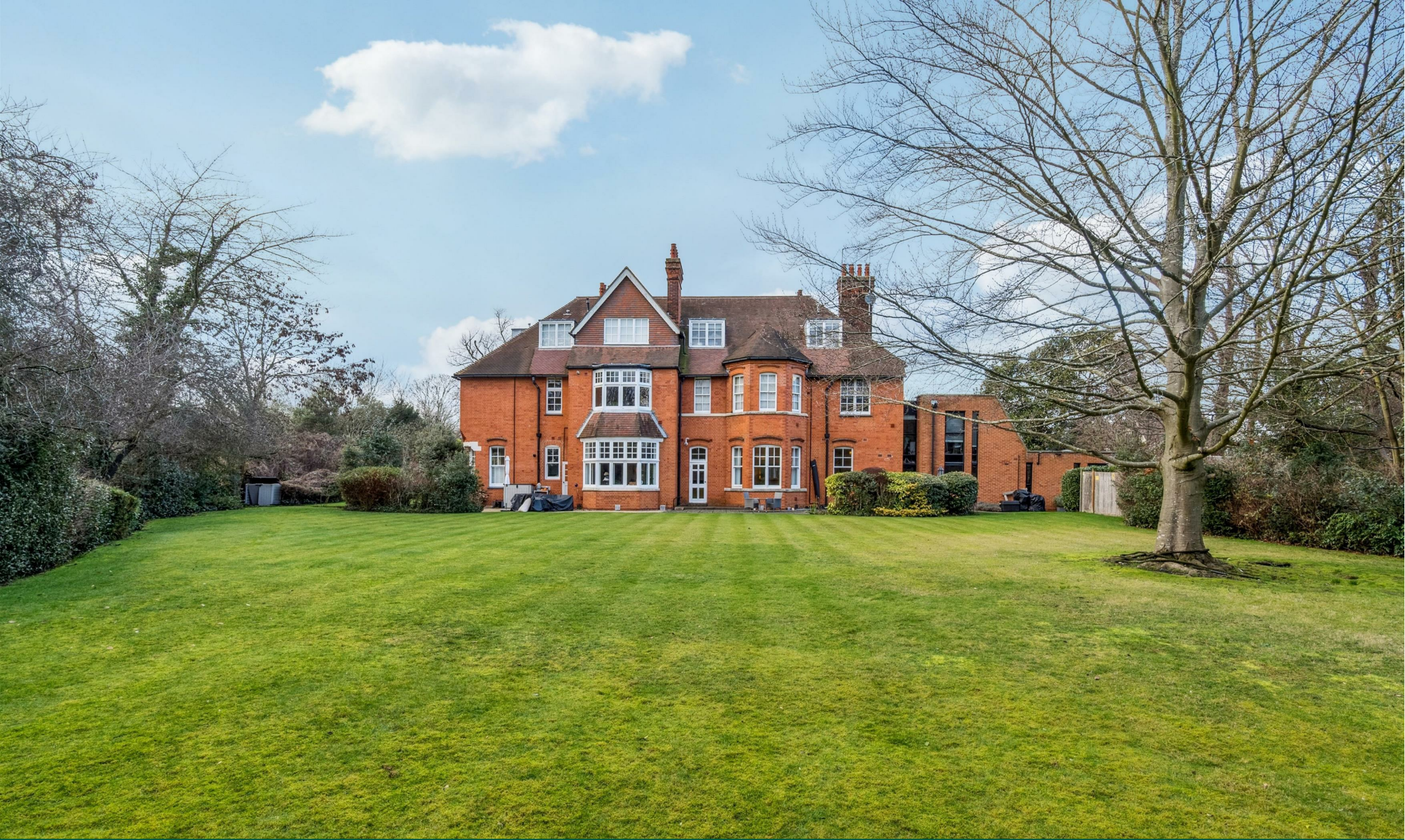
The Gatehouse, London, W4 Guide Price £899,950